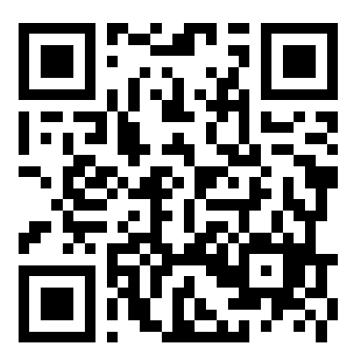
Google Form QR code